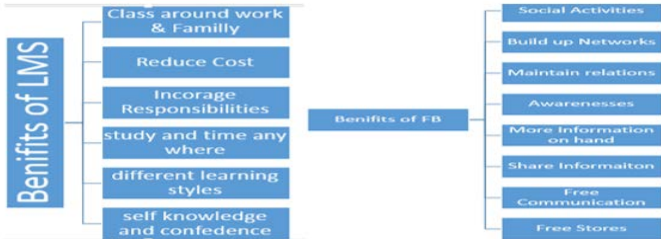
Figure 1.0 Benefits of LMS and Facebook

(ICT) has pervaded every aspect of people's personal and social natural life. This kind of new technology is used not only at home, but also in workplaces, public and private organizations, and schools for several dedications, via different tools and with far-reaching consequences.